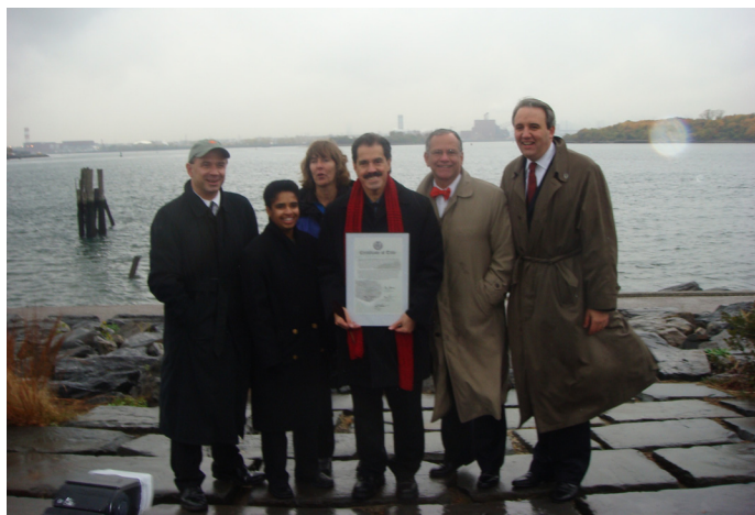
Officials celebrate South Brother Island purchase

The 2007 nesting season was a comprehensive survey year, which has been set on a once-