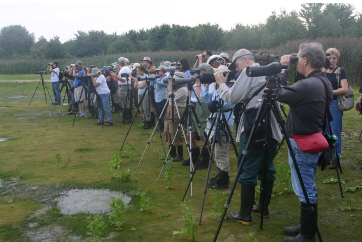
Shorebird Festival at Jamaica Bay Wildlife Refuge

42nd Street Development Corporation ConEdison Conoco Phillips Bayway Refinery Corcoran Cares DNA Contracting LLC The Durst Organization Fiduciary Trust Company International General Contractors Association of New York HSBC Lindblad Expeditions* National Audubon Society Joel Oppenheimer, Inc.* THE POINT, Community Development Corporation Quisisana Resort* *in-kind contributions