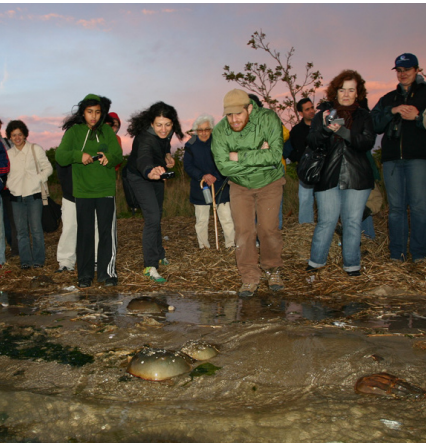
Horseshoe Crab tour at Jamaica Bay