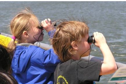
Eco-cruise on the East River aboard a NYC water taxi