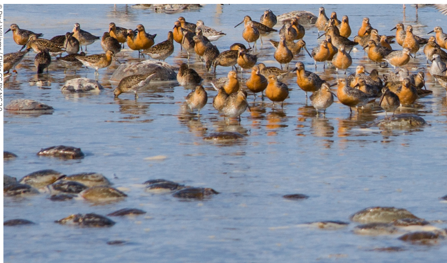
Red Knots depend on the eggs of Horseshoe Crabs for food to fuel their long migratory journeys.

For more information on these festivals, visit go.nycbirdalliance.org/fest . ■