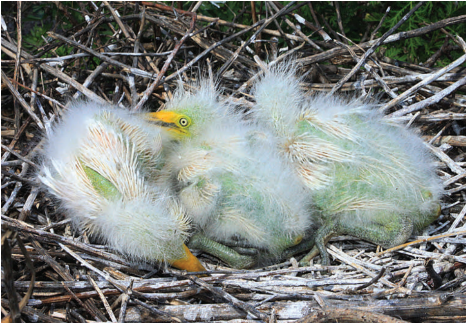
Great Egret Chicks on Jamaica Bay's Restored Elders Point East Island

In mid-June, the National Park Service (NPS) formally adopted a new General Management Plan for Gateway National Recreation Area, the first update in 35 years.