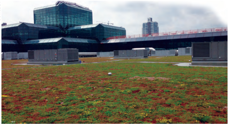
The Jacob K. Javits Convention Center's 6.75-Acre Green Roof Is an Inviting Habitat for Birds, Bats, and Insects

microphones, and sounds captured by these microphones are turned into spectrograms. Because it is not possible to know how many individual bats are calling, researchers use an “index of activity” to compare relative activity between sites and, when possible, species.