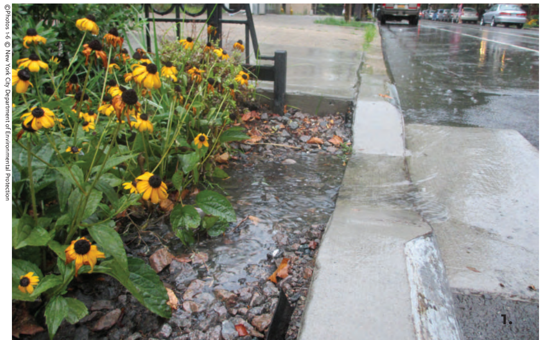
1. RIGHT-OF-WAY BIOSWALES like the one pictured at the corner of Dean Street and 4th Avenue in Brooklyn are the most common type of green infrastructure in the DEP’s toolkit for stormwater management. Runoff from the street is directed into the bioswale, a planted area in the sidewalk, where it is absorbed by engineered soil and a subsoil layer of stones, and infiltrates into the soil below. Some of the stormwater is also taken up by the vegetation for eventual evapotranspiration (water loss due to a combination of evaporation and plant transpiration).

The green solutions to capture excess stormwater runoff being employed by New York City’s Department of Environmental Protection (DEP) run the gamut from small, individual sidewalk plantings to complex, multiyear projects encompassing wide areas and using methods as complicated as wetland construction. The samples shown here illustrate the broad range of bioinfiltration projects currently in use in the City. For more information about other forms of green infrastructure, such as permeable pavements and blue roofs, or to learn about DEP’s Green Infrastructure Grant Program, visit www.nyc.gov/greeninfrastructure .